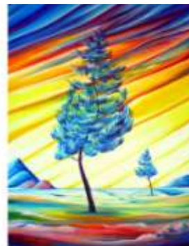
Thick Frost Glow II By: Timothy Sorsdahl

Use online discount code: 9KREPD379 Offer valid 12/1/09 - 12/31/09 Cannot be combined with any other offer or discount