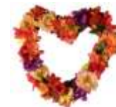
Online floral gifts